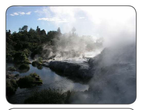
Geothermal power relies on heat in Earth's crust.

One drawback is that this kind of power cannot be found everywhere. Geothermal power plants rely on geothermal reservoirs. These form when hot rock in the Earth's crust comes into contact with underground water. These reservoirs are only found in certain parts of the world. The best places to find geothermal reservoirs are areas around plate boundaries or areas with a lot of volcanic or seismic activity.